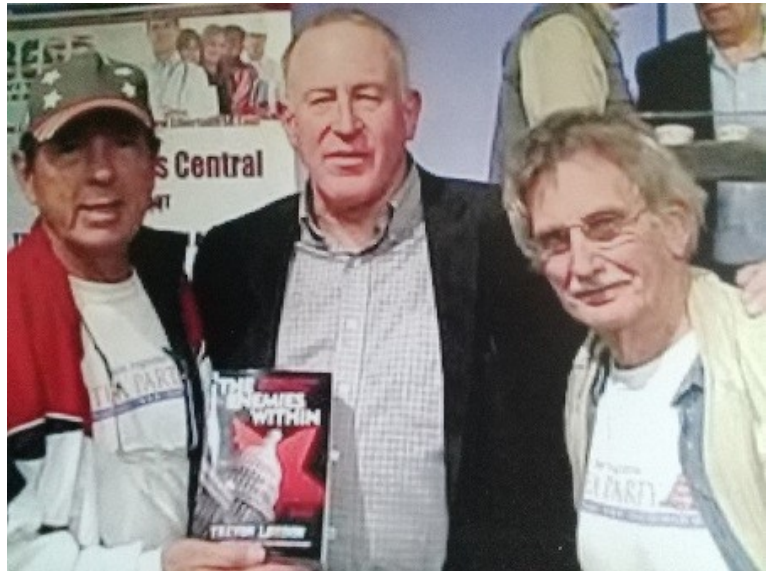
TCCR Staff Photo

There is an old political cliché that goes something like this, 'A strong leader, a weak people' and vice versa, "a weak leader, a strong people'. A perfect example was President Trump's massive crowds at his rallies and wheeling and dealing, like the sole proprietor that he is, with amazing success and approval. But when the rug was pulled out from under Trump by the CPP