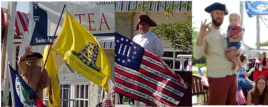
TCCR Staff Photos

Many in the public thanked the SATP for joining their Memorial Day Parade.